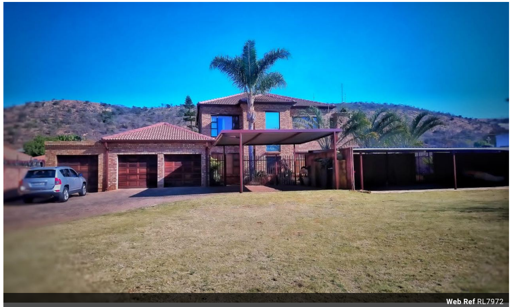
Web Ref RL7972

555 Jennings Street Dasport Pretoria 0082