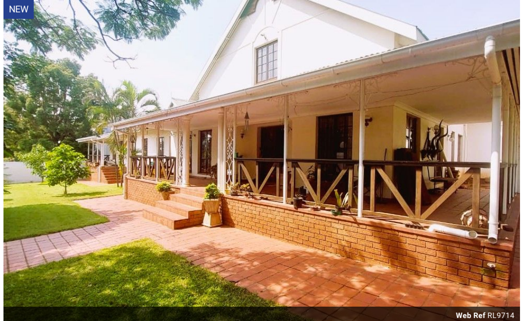
Web Ref RL9714

555 Jennings Street Dasport Pretoria 0082