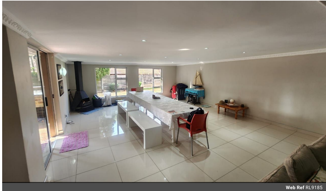
Web Ref RL9185

555 Jennings Street Dasport Pretoria 0082