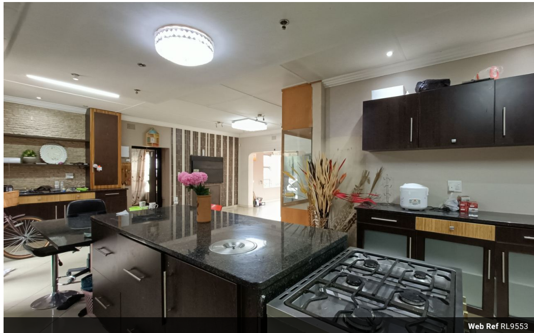
Web Ref RL9553

555 Jennings Street Dasport Pretoria 0082