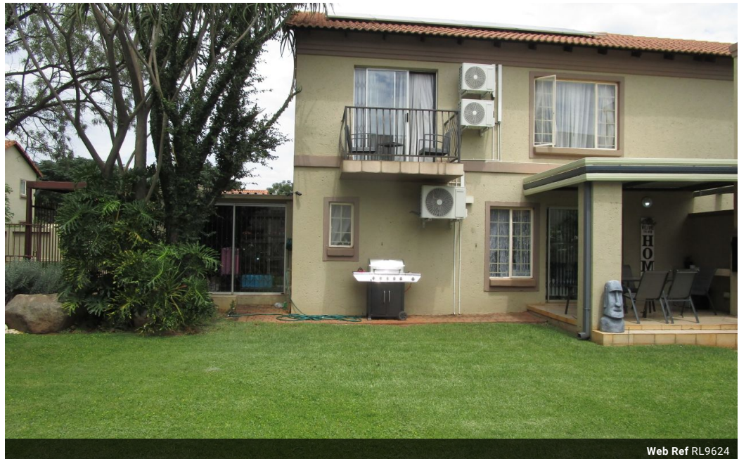
Web Ref RL9624

555 Jennings Street Dasport Pretoria 0082