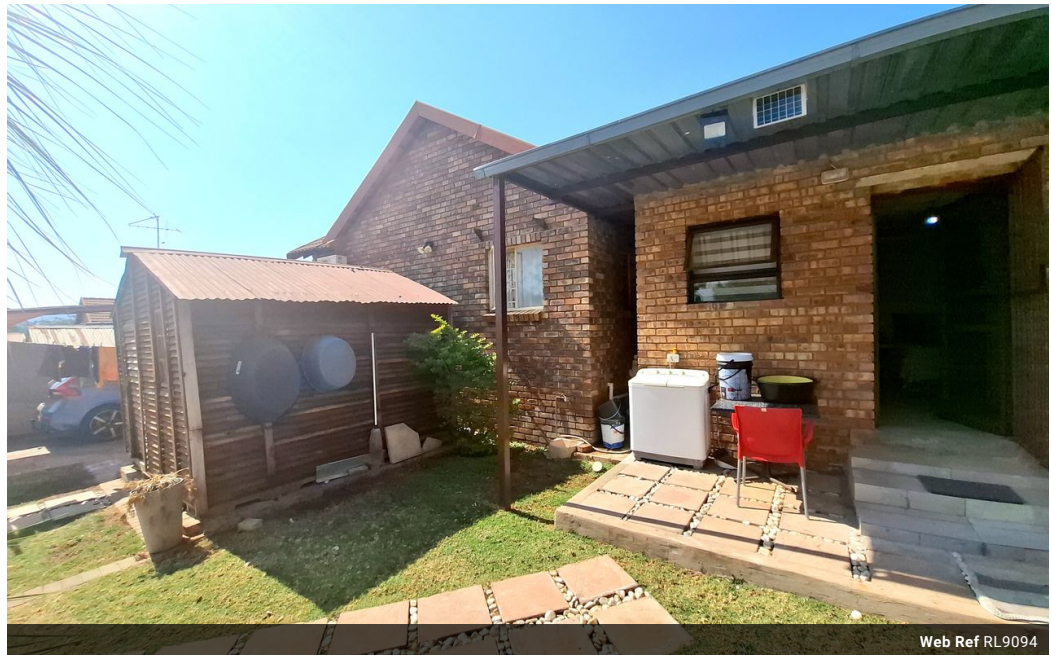
Web Ref RL9094

555 Jennings Street Dasport Pretoria 0082