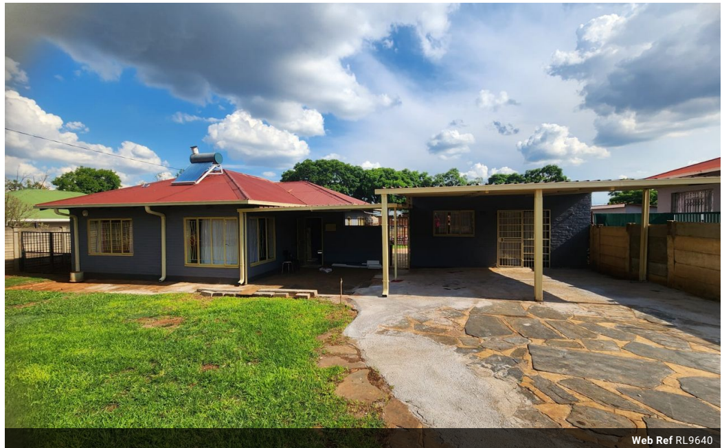
Web Ref RL9640

555 Jennings Street Dasport Pretoria 0082