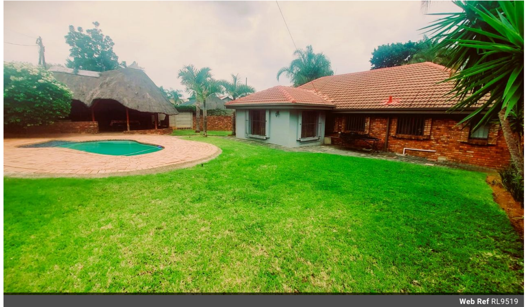
Web Ref RL9519

555 Jennings Street Dasport Pretoria 0082