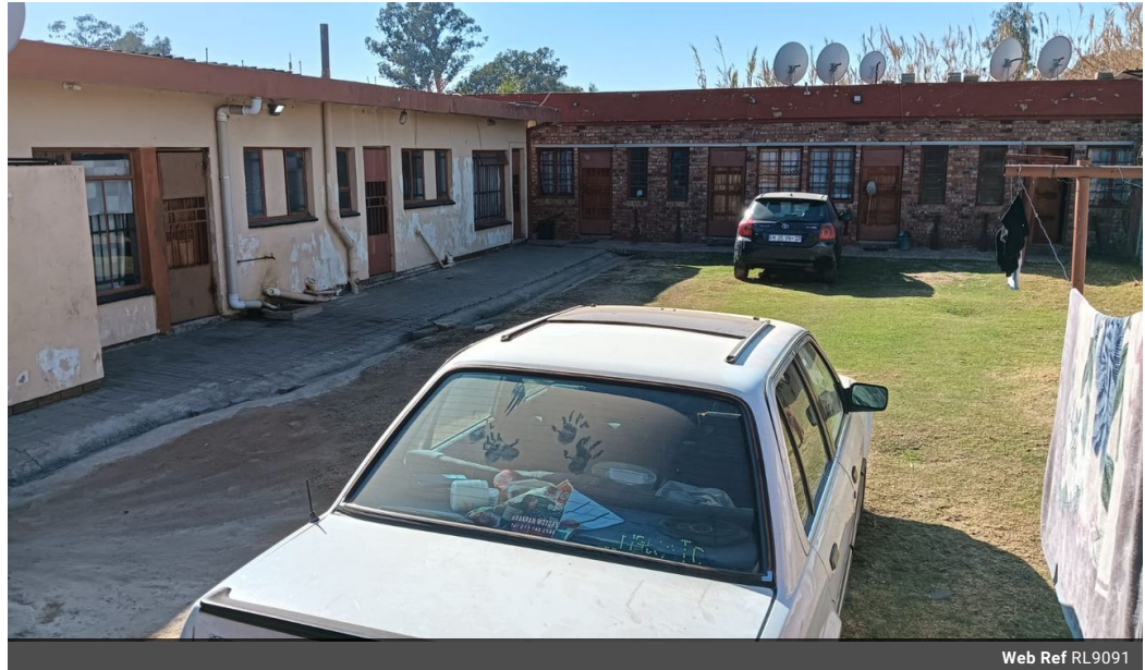
Web Ref RL9091

555 Jennings Street Dasport Pretoria 0082