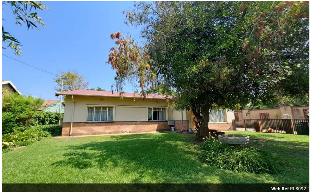
Web Ref RL8092

555 Jennings Street Dasport Pretoria 0082