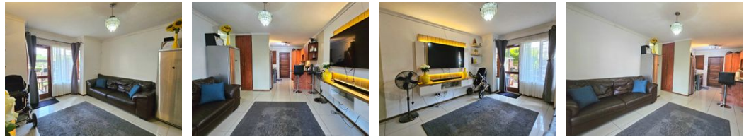
Web Ref RL9598