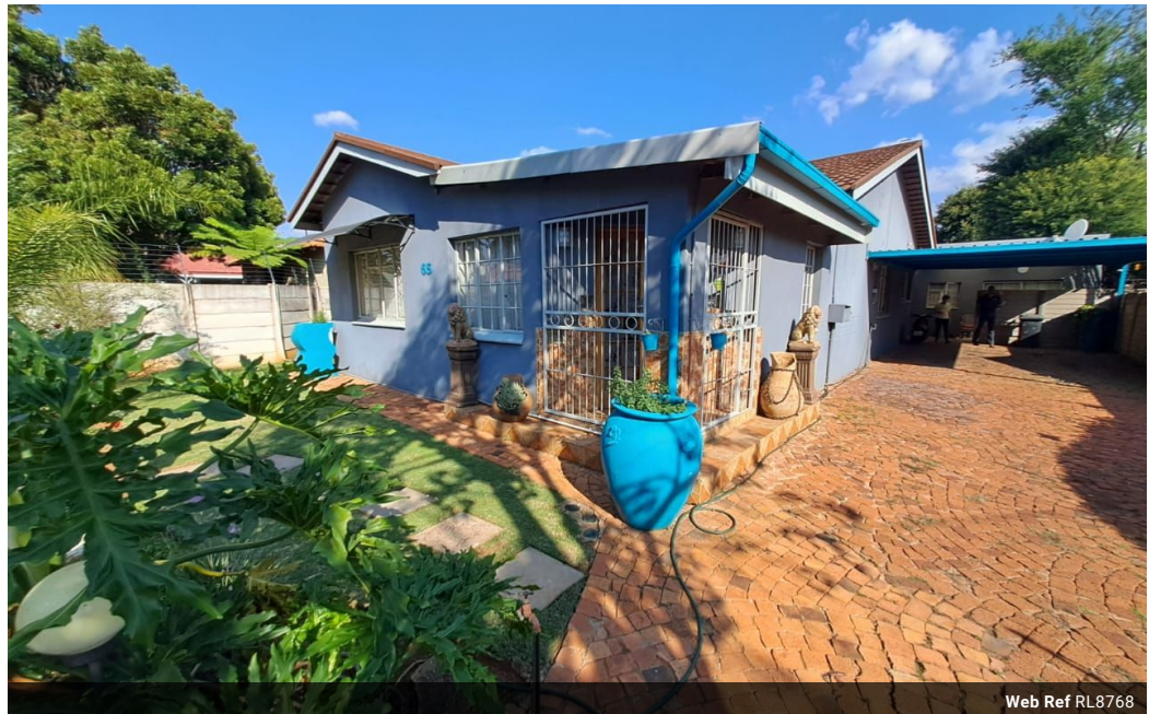
Web Ref RL8768

555 Jennings Street Dasport Pretoria 0082