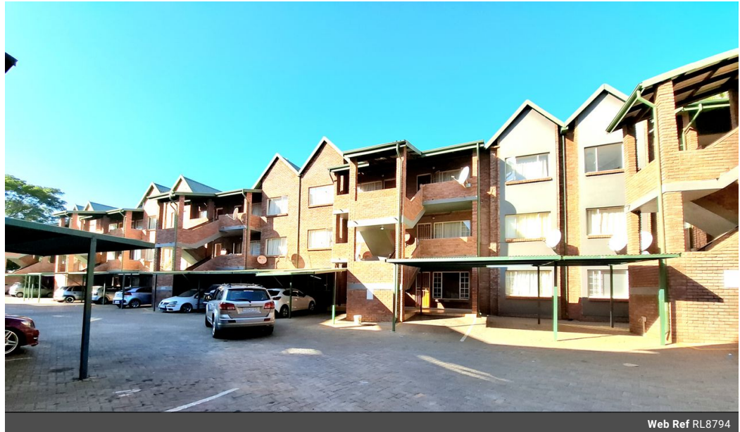
Web Ref RL8794

555 Jennings Street Dasport Pretoria 0082