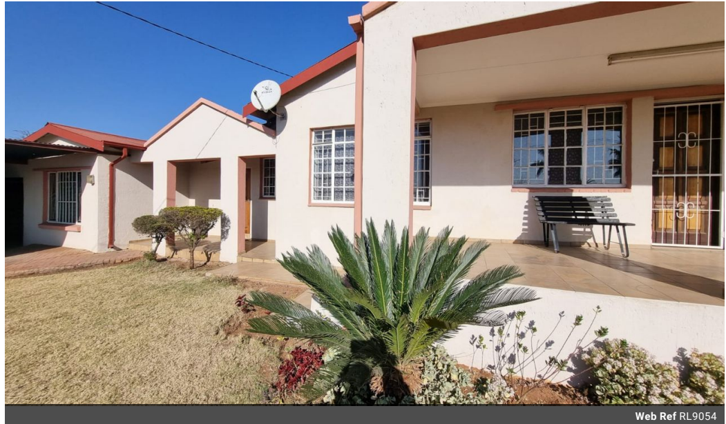
Web Ref RL9054

555 Jennings Street Dasport Pretoria 0082