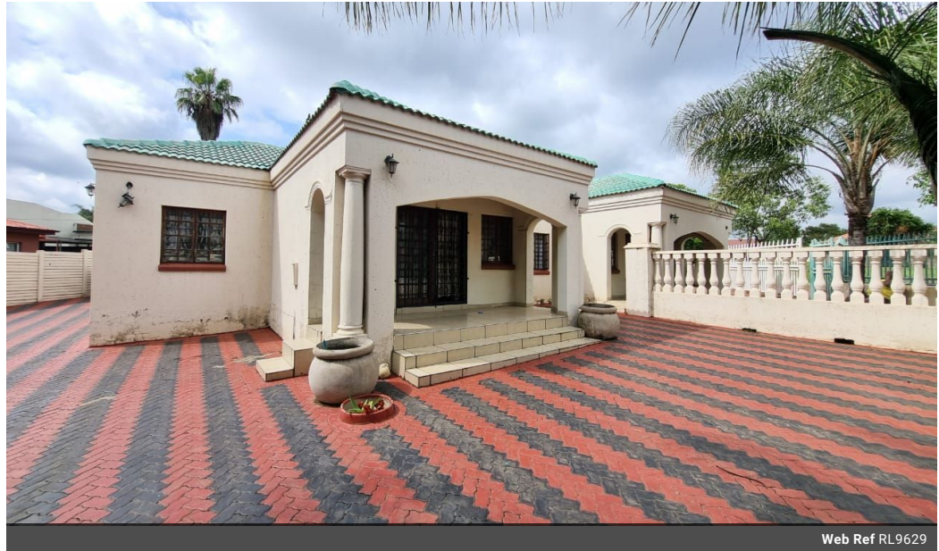
Web Ref RL9629

555 Jennings Street Dasport Pretoria 0082