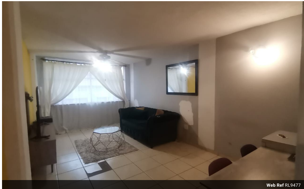
Web Ref RL9477

555 Jennings Street Dasport Pretoria 0082